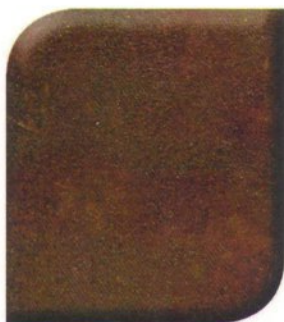
CS-14 Dark Walnut