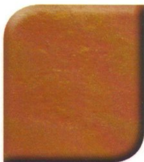
CS-16 Faded Terracotta