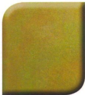
CS-12 Weathered Bronze*