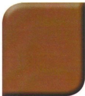
CS-2 Padre Brown