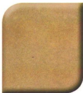
CS-15 Antique Amber