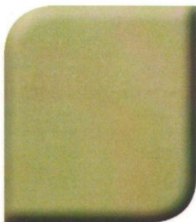
CS-11 Fern Green*